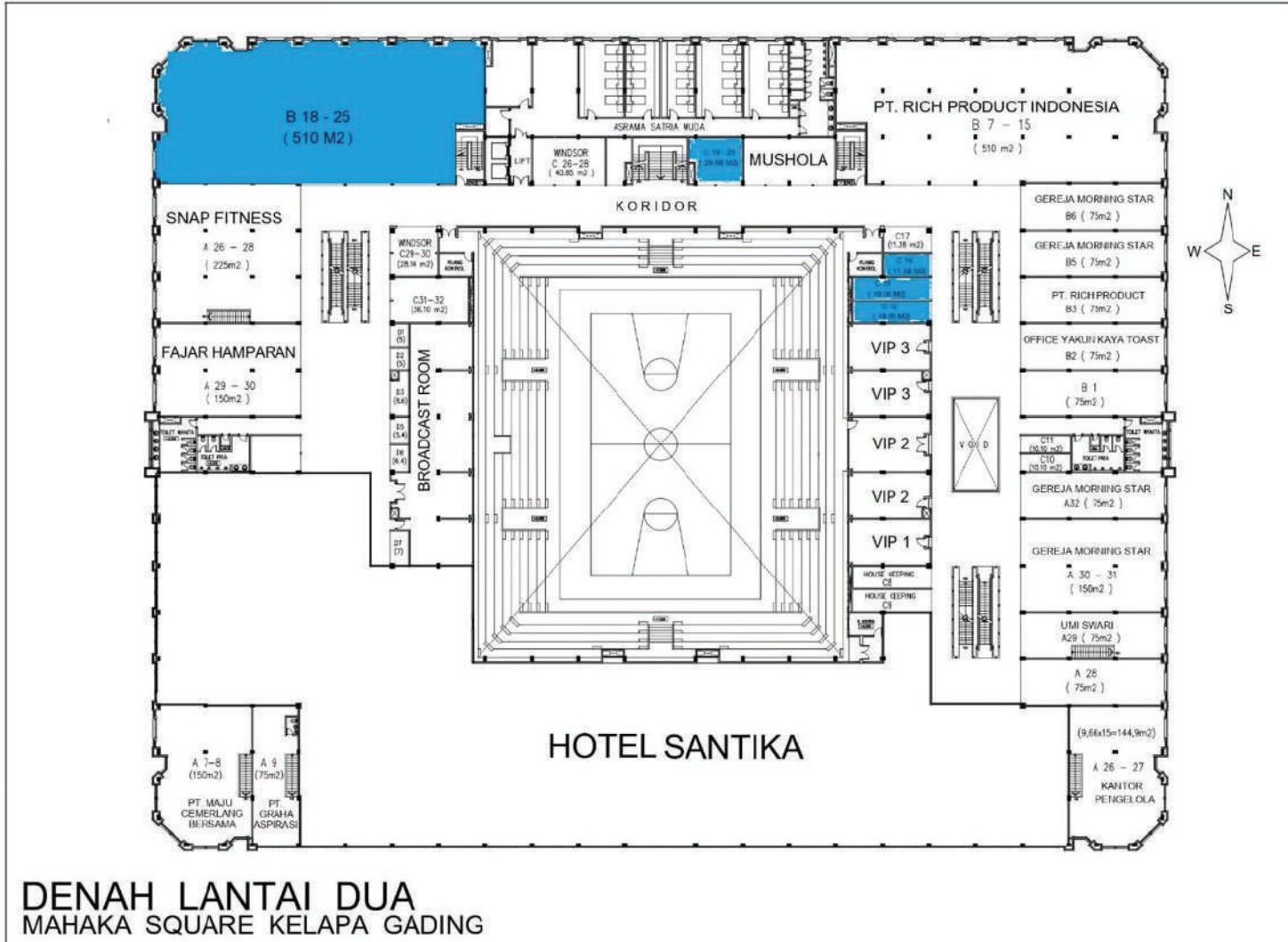
DENAH LANTAI DUA MAHAKA SQUARE KELAPA GADING

MAHAKA SQUARE, JAKARTA 16-17 NOVEMBER 2024